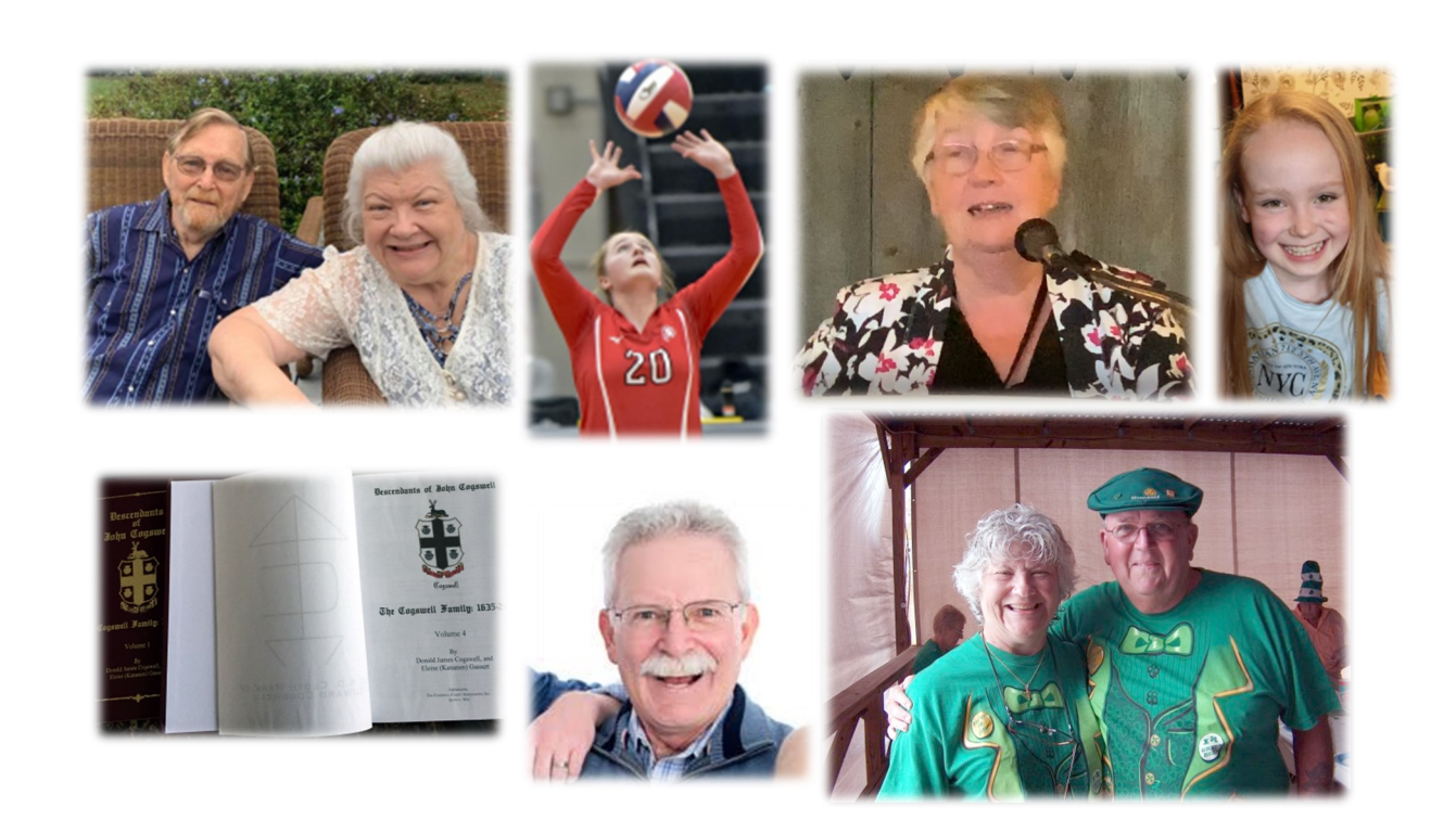
"I neither despise nor fear" December 2019