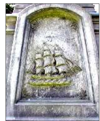
Sailing ship relief on Seaman's Memorial in Lincoln Park, 2008

<sup>1</sup>"Desolate and Forsaken. Neglected and Forlorn Condition of the City Cemetery," San Francisco Examiner, 3 February 1891, page 3.