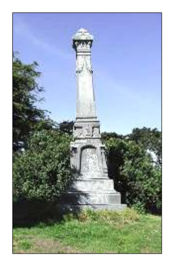
Seaman's Memorial in Lincoln Park, 2008.

On a drive of the Lincoln Park golf course in San Francisco, stands an interesting metal hazard for players. A monument fifteen feet high, decorated with nautical reliefs of anchor and sailing ships, the stile is left over from the days when Lincoln Park served as the City Cemetery.