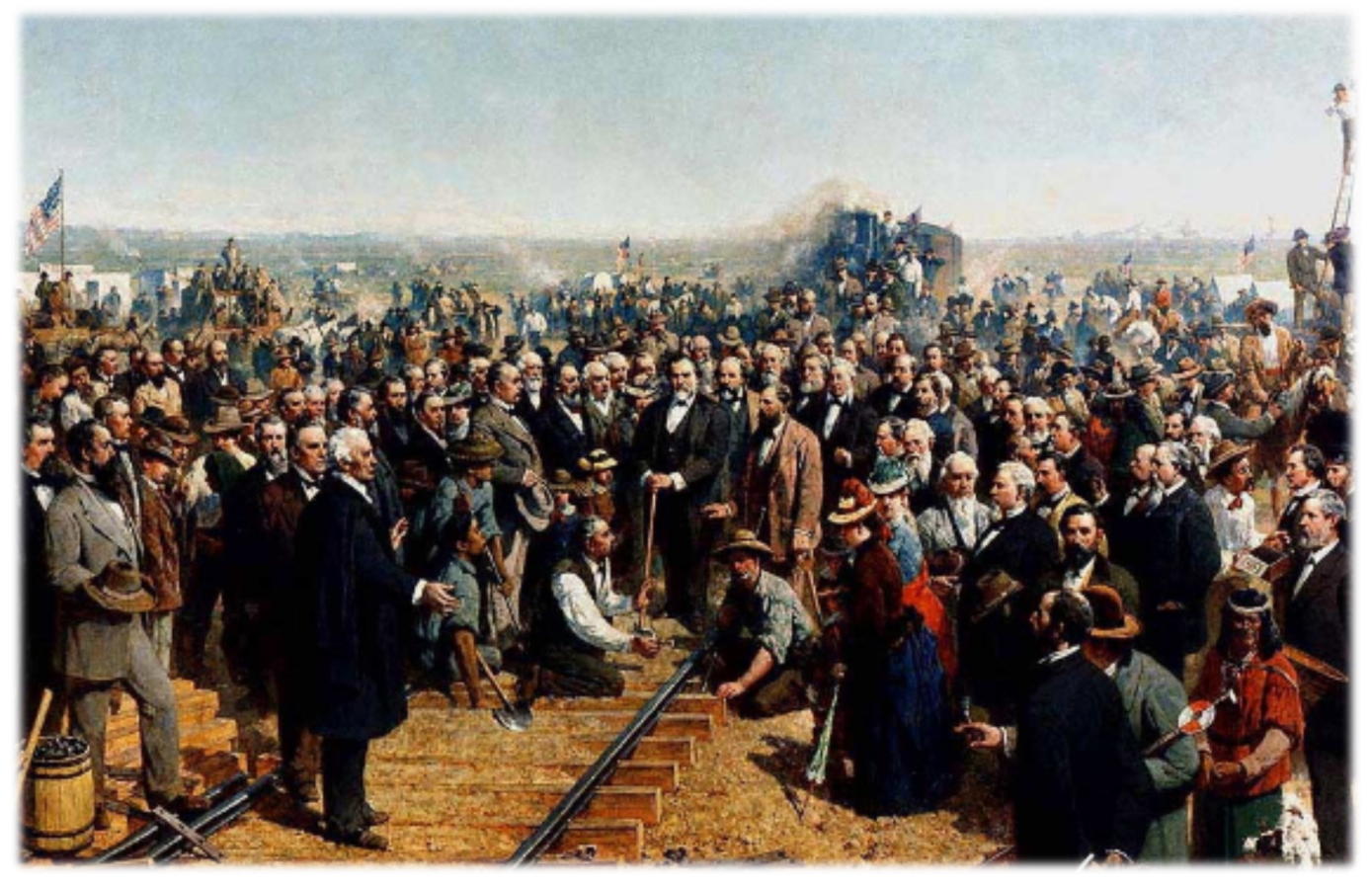
The Last Spike (1881) by Thomas Hill