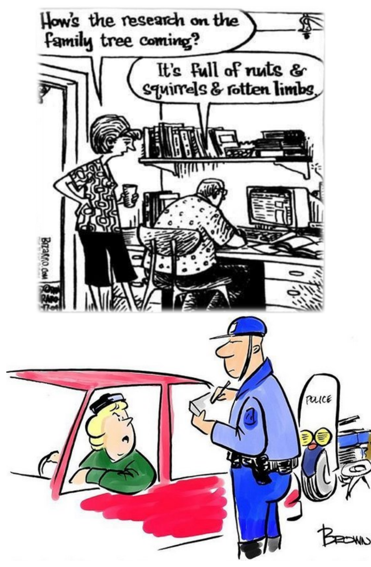
"Do you know whose great-great granddaughter you're ticketing!"

Howard Cogswell contributed the following: